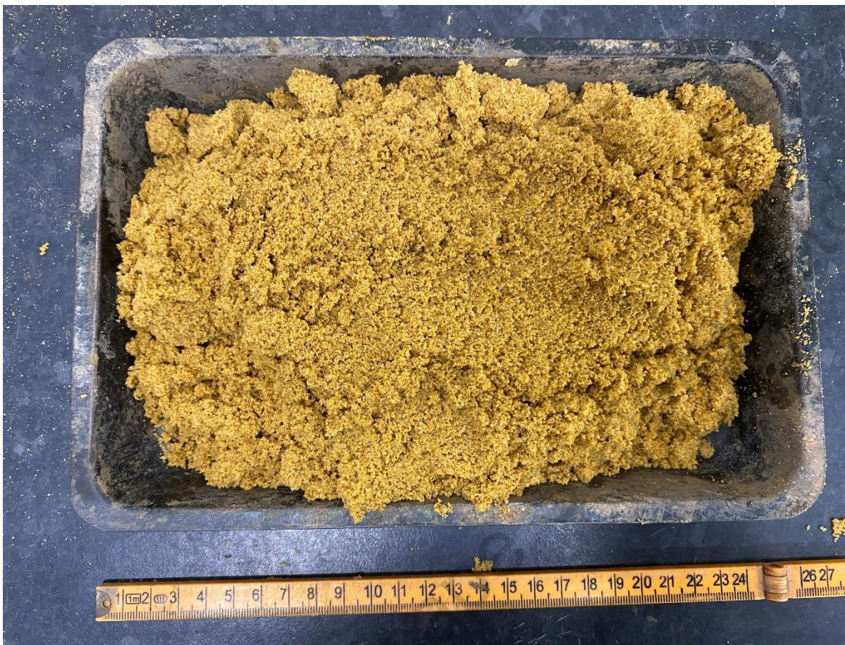
Plate 1: Medium / Coarse Washed Silica Sand (E) Sample